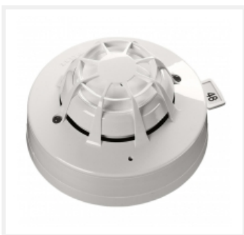
Apollo XP95 55000-885 Multisensor Detector