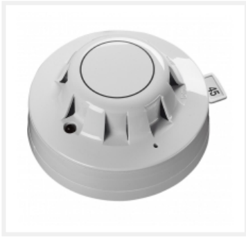
Apollo XP95 55000-500 Ionisation Smoke Detector