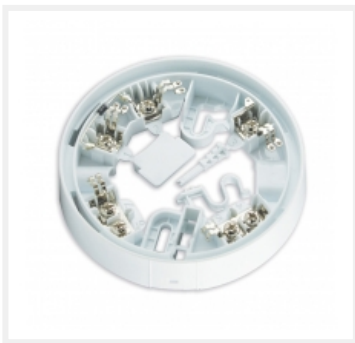
ActiV Diode Base