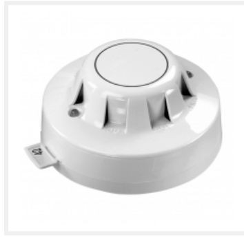
Apollo Discovery 58000-600 Optical Smoke Detector