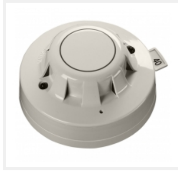
Apollo Discovery 58000-500 Ionisation Smoke...