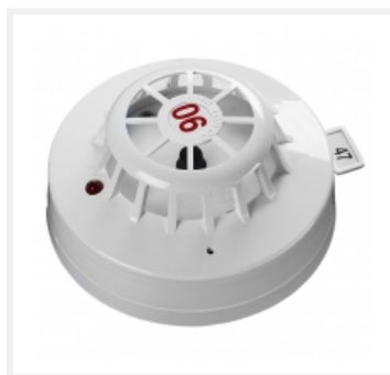
Apollo XP95 55000-401 High Temperature Detector