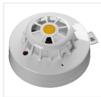
Apollo XP95 55000-400 Standard Temperature...