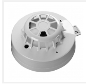
Apollo Discovery 58000-400 Heat Detector