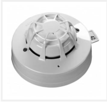
Apollo Discovery 58000-700 Multisensor Detector